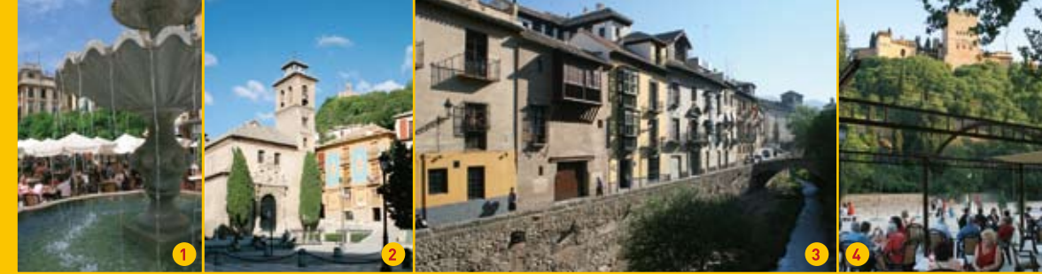
EL BAÑUELO [THE ARAB BATHS] Tel: 958 229 738