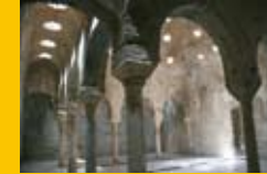
ARCHAEOLOGICAL MUSEUM Tel: 958 225 603