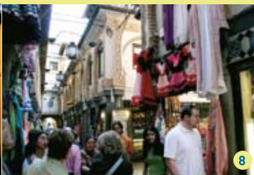
CATHEDRAL Tel: 958 222 959