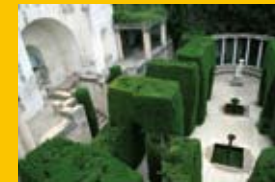
INSTITUTO GÓMEZ MORENO Tel: 958 227 497 Situating in a building alongside the Fundación Rodríguez Acosta. It houses an interesting art collection.